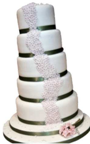
Wedding cake: Five different flavoured tiers by The Great Little Cake Company www.thegreatlittlecakecompany.co.uk