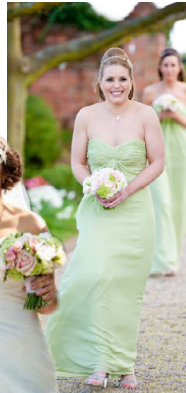
Bride's dress: 'Blue' by Enzoani. Bride and bridesmaids dresses from Brenda Lorraine Bridal Wear www.brenda-lorraine.co.uk