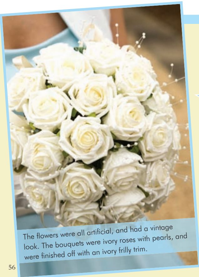
The flowers were all artificial, and had a vintage look. The bouquets were ivory roses with pearls, and were finished off with an ivory frilly trim.